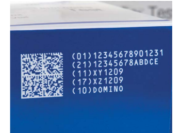
Cardboard: GS1 compliant codes for serialisation and unique identification.