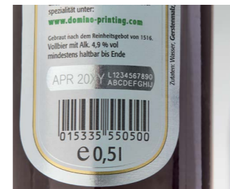
Paper label: glass bottle label marking at speeds of up to 70-90k bph.