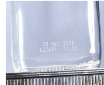
Glass: the Dx-Series codes at high speeds, in excellent quality even on tough substrates.