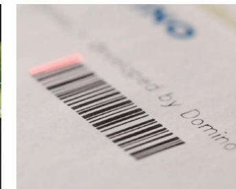
Labels: Dx-Series can be seamlessly integrated into labelling machinery for high-precision labels.