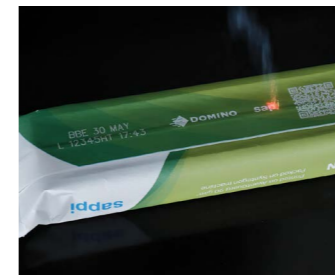
Paper based wrappers: marking algorithms that are gentle enough to code modern, sustainable packaging materials while keeping protective barriers intact.