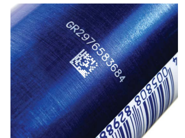
Coated metal: precise marking on convex or concave surfaces.