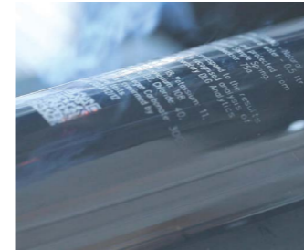
Label replacement: unlimited lines of text and complex 2D codes to support the move to labelless.

Our laser specialists are on hand to help define the ideal configuration for your specific application.