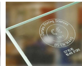
Glass: designed for toughened and laminated glass panes.