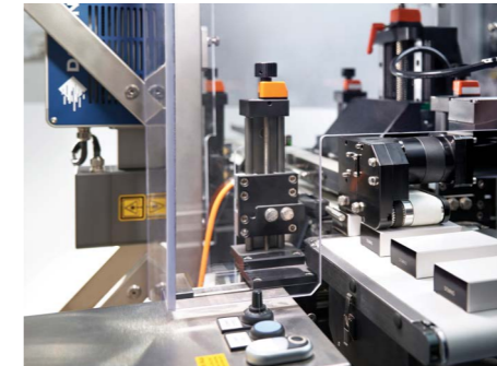
Custom-made laser guarding; laser safety training courses are also available.