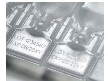
Plastics: pin-sharp codes on plastic materials, ideal for wide marking fields.