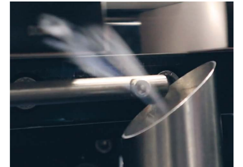
Domino's DPX fume extraction systems effectively filter fume and particulate debris from the coding process.

Our services are designed to provide operational insight so you can eliminate downtime and maximise production efficiency.