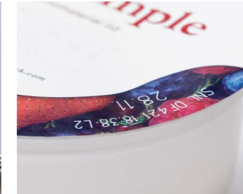
Films: ideal for pots and stickpacks: large marking fields, pin-sharp small characters.