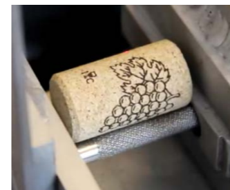
Cork: graphics and logos in brilliant clarity to complement your brand.