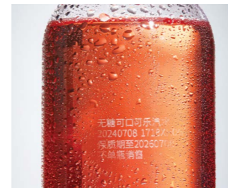
PET: ideal for the beverage industry, designed for high production rates and with optional IP65 certified protection.