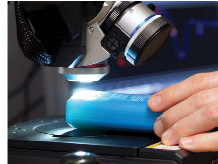
Scientific substrate analysis and sampling at Domino's laser labs.